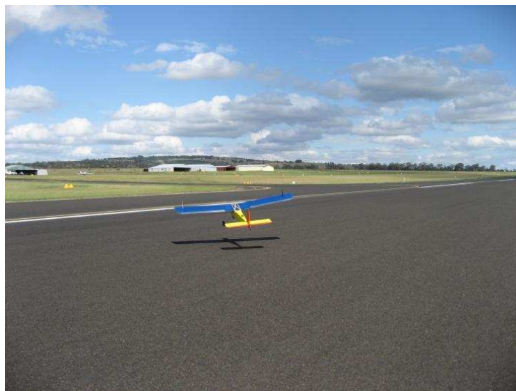
Team Telemaster entry taking off at Outback 2008