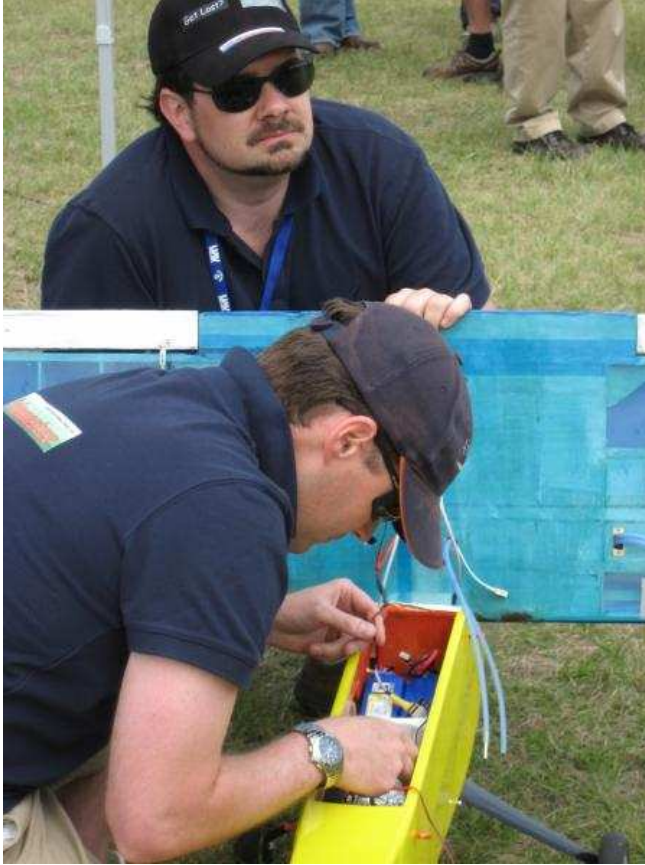
Where the Magic happens