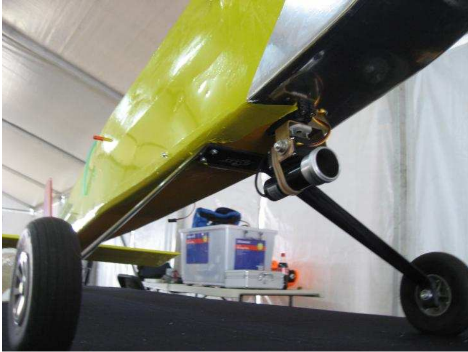
A drafty camera mount view