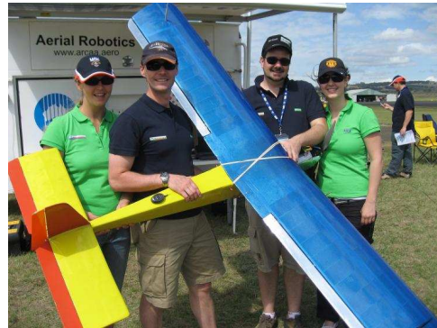
Telemaster Team Group Photo