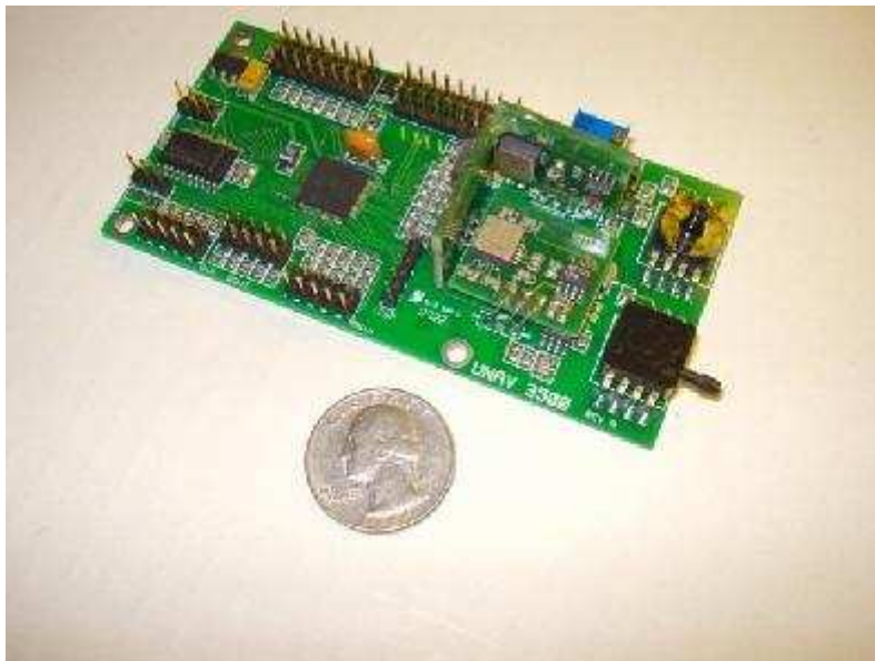
UNAV3500 Series Autopilot Board (By UNAV-LLC)